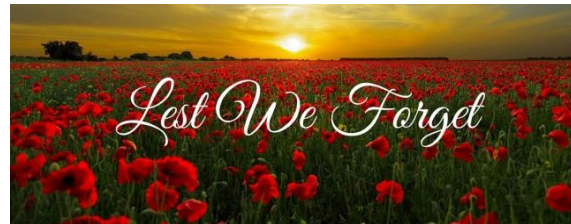
Wreaths laid on ANZAC Day