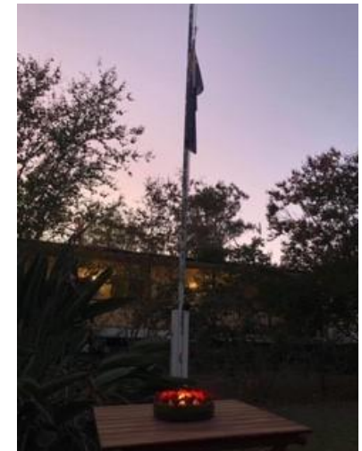
Scenic Rim Community Spirit Lighting up the Dawn