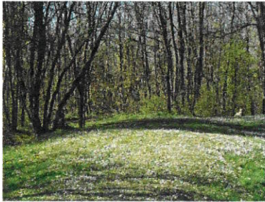
Battlefield at Verdun (1914-1918)

My father and his mum were born not far from Verdun where the big battle in 1916 took place. Their village of Charny was completely destroyed and rebuilt a few years later. The following pictures -761 to 773 are the pictures of the fort of Douaumont. At Verdun 360000 French and 340000 German did dies. My father as a kid went to plough the fields with his uncle and theirs draught horse on his farm. My father's job when he was a kid , was to collect any human bone which were coming back to the surface of the field and put them in a bag. At the end of the day if they did found any , they would give them to the local priest. The priest would bless them and then give them to the local ossuary.