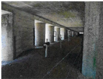
La tranchee des baillonettes

On the 10/06/1916 two companies of the 137 th Regiment of Infantry were buried alive in their front line trench by shelling. Only the tops of their rifles protruded above the ground. This poignant tomb is preserved as a Memorial